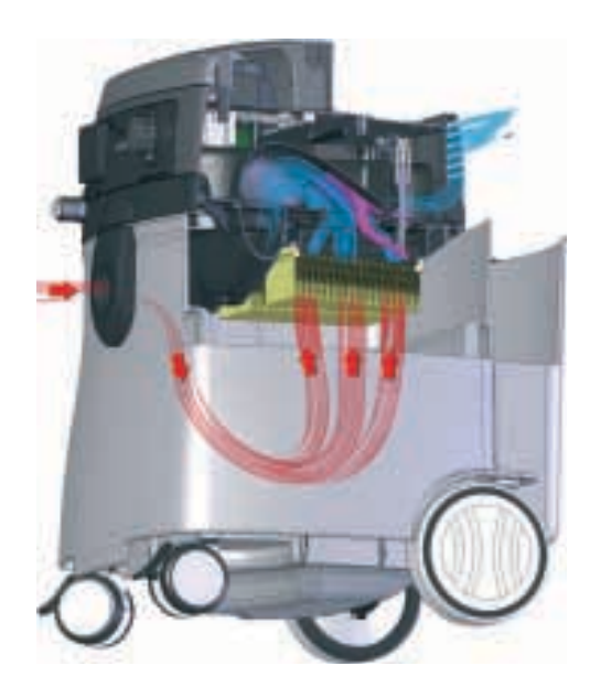
Air cycle during normal operation