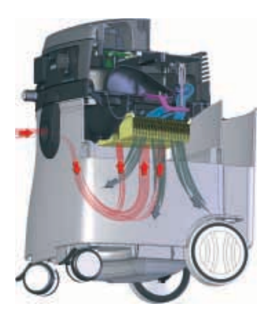
Air cycle during filter cleaning