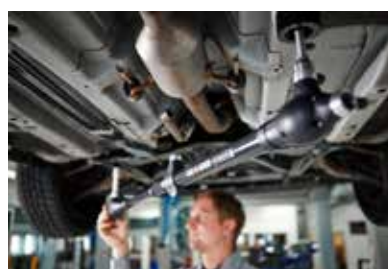
One technician can easily manage the entire diagnosis

Vision2 - PointX , compatible with PointX , is integrated with Car-O-Data, the world's largest vehicle database, making it easy to find