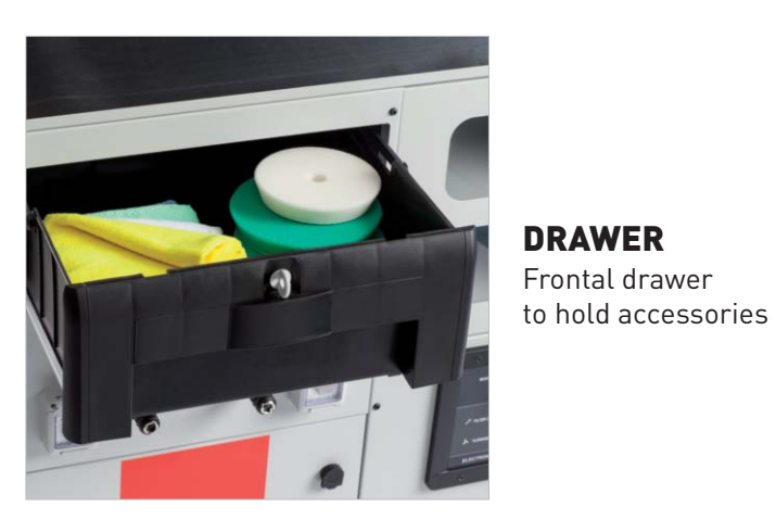
DRAWER Frontal drawer

Everything is ready to be used and taken directly from KR2 unit