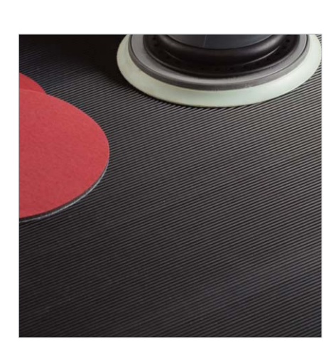
Table top with ribbed rubber cover (dimension 90x47 cm)